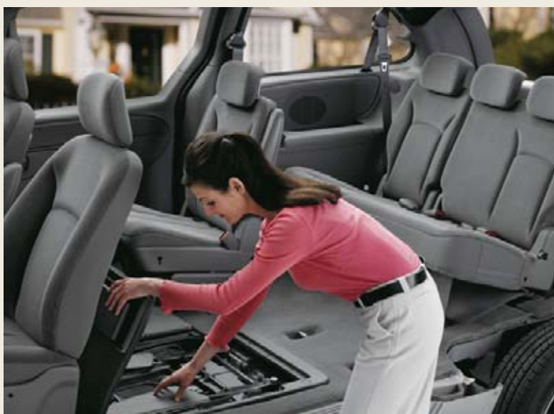
"STOW 'N GO," one of the many MAGNA automotive products, is a 2nd-row seat configuration that enables "full flat floor," with the seats folding down beneath the floor.

Parts maker's business range rivals that of automakers